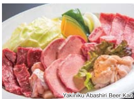
Yakimiku Abashiri Beer Kan